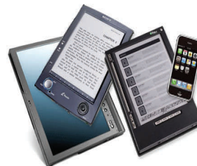
Various types of e-readers.

As you can see, it's complicated. That's why Branigan Library must make sure that the vendor we choose can work within our budget, offer titles that appeal to Library customers, offer a service that is user friendly and also coincide with the library's collection development policy.